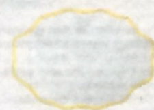
Yellow scalloped edge place mat.

alist to embrace these things," says Semkuley. "It could be any kind of dinner party — these concepts and ideas are just insanely good."