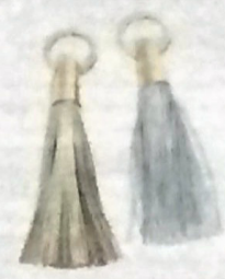
Gold and silver tassel napkin rings.